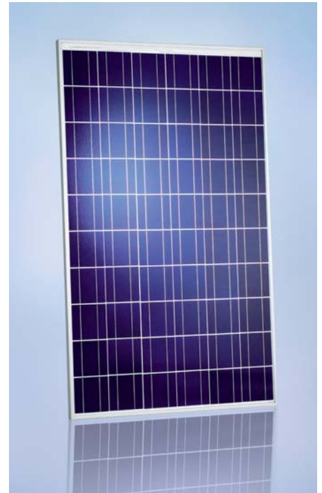
SCHOTT POLY™ 217/225/232